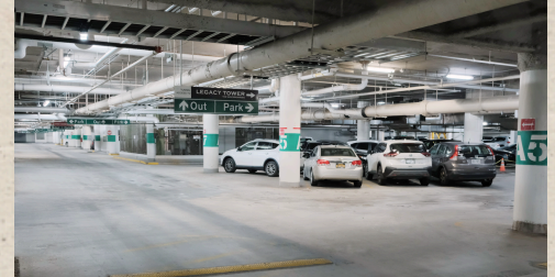
SAFE, CONVENIENT PARKING