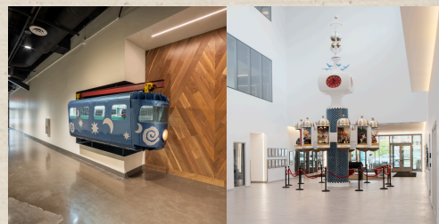
TWO LOCAL LANDMARKS