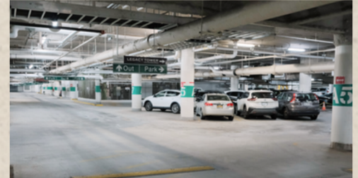
SAFE, CONVENIENT PARKING