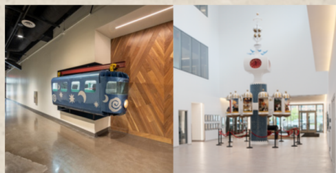
TWO LOCAL LANDMARKS