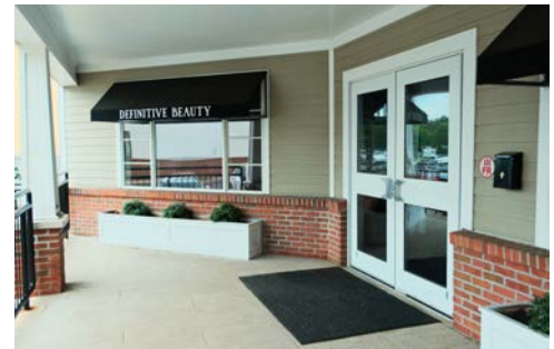
PRIVATE ENTRANCE WITH PATIO SPACE